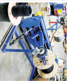
HEAVY DUTY RESPOOL