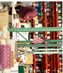
CUT & STRIP